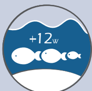
Growing & Fattening