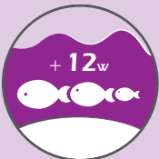
Growing & Fattening